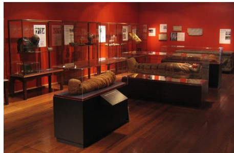
Figure 2: Photographs of Egyptian Gallery, Nicholson Museum, Sydney.